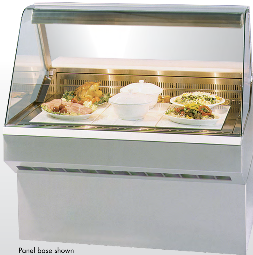
Panel base shown

Market Deli. The low profile merchandiser that provides solutions to your fresh food merchandising needs. Cases are available in lengths of 3', 4', 6', and 8'. Designed for continuous case line-ups without middle end glass.