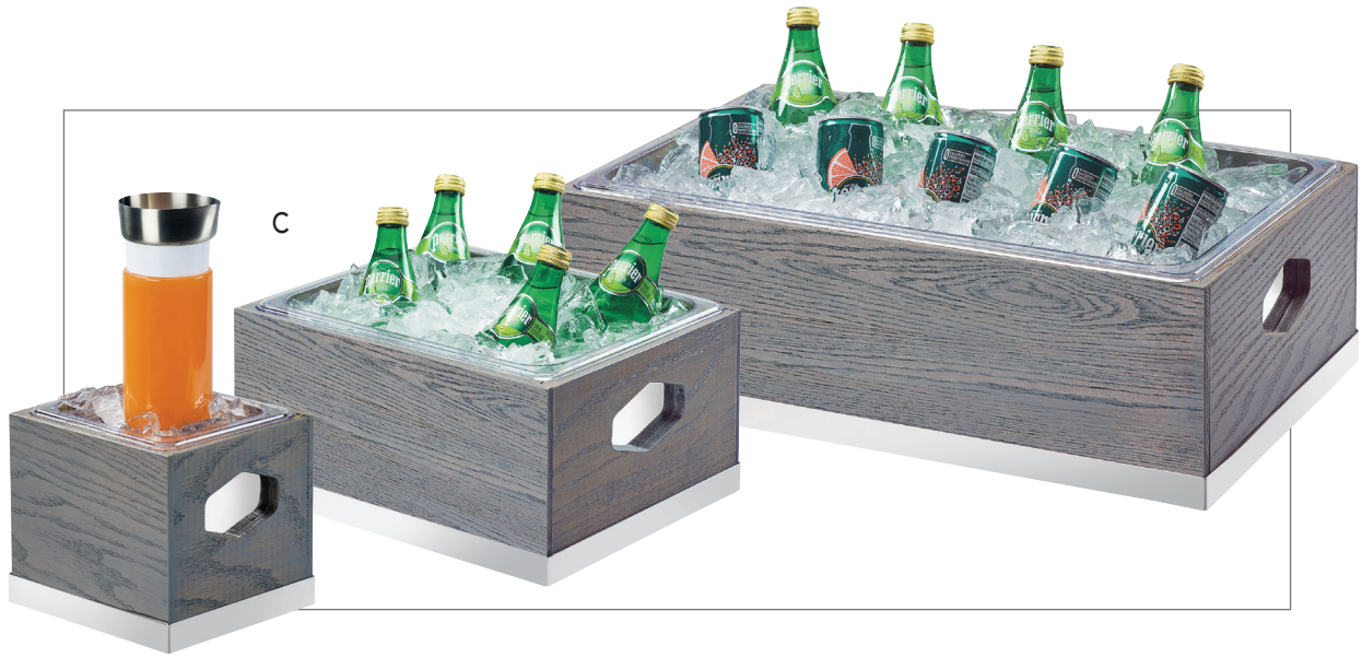
C. ASHWOOD ICE HOUSINGS Includes Clear Polycarbonate Pan. ITEM 3800-6-83 | 7½Wx7½Dx7H ITEM 3800-10-83 | 13¼Wx11Dx7¼H ITEM 3800-12-83 | 21¼Wx13¼Dx7H