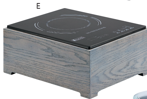
E. ASHWOOD INDUCTION UNIT Includes Induction Burner. ITEM 3633-83 | 12¾Wx16Dx7¼H