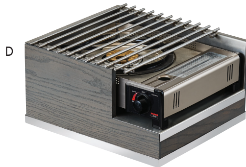
D. ASHWOOD BUTANE STOVE FRAME Optional Butane Stove Sold Separately. ITEM 3816-83 | 12Wx14Dx7½H ITEM 4010-I | Optional Butane Stove