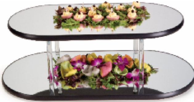
#2264, and #266, oval