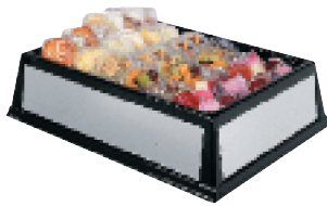
Large #299, mirrored sides