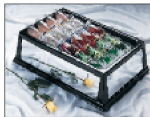
Small #297, mirrored sides