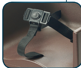
3-point center harness restraint