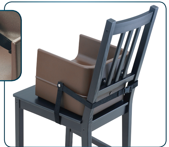
Secure to chair back and seat

New Jersey: 888-946-2682 Florida: 786-536-4656 California: 888-946-2652