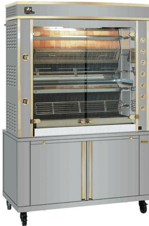
GF1375-5 Gas + Roof + Base Cabinet SSP: Stainless steel with Black enamel front panels

Rotisol's GrandFlame Rotisserie Ovens epitomize beauty and functionality, featuring a unique cooking system. Visible flames & elegant finishes provide atmosphere, quality & design provide dependability and spit options and accessories allow for increased diversity.