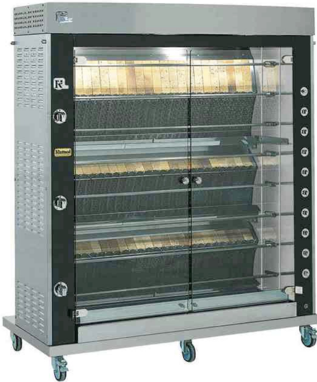
GF1675-8 Gas + Roof + Base Cabinet SSP: Stainless steel with Black enamel front panels

Rotisol's GrandFlame Rotisserie Ovens epitomize beauty and functionality, featuring a unique cooking system. Visible flames & elegant finishes provide atmosphere, quality & design provide dependability and spit options and accessories allow for increased diversity.