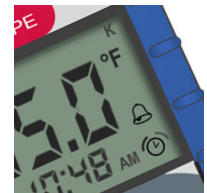
Count-down timer and alarms