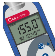
Max/Min feature recalls highest and lowest reading