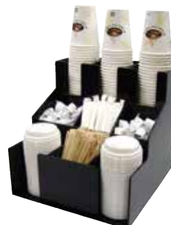
CLSO-3T 12-5/16"L x 12-3/4"W x 13-1/8"H