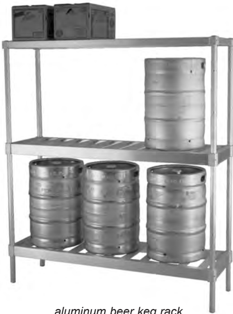
aluminum beer keg rack

Eagle Aluminum Beer Keg Rack, model _____. Heavy duty extruded aluminum construction with two heavy duty shelves for kegs, and a third shelf for general storage. Shelves are adjustable in 2" increments. Posts are 1 1/8"-diameter, marked in 2" increments with end caps on each end. Shipped knocked down.