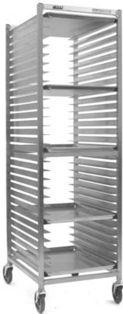
all-welded pan rack #OUR-1830-2/W

Eagle Panco® All-Welded Pan Rack, model _____. Front-loading and side-loading models available. Constructed of 1" square tubular aluminum frame and supports. 1½" x 1½" extruded aluminum tray slides with two raised beads to minimize friction. Slides are welded to vertical posts. Slide spacing to be 5", 3", or 2" to accommodate (10, 12, 20, or 30) full size sheet pans. Furnished with 5"-diameter casters. Shipped assembled. #OUR-1810-3/W rack is 38" tall and features stainless steel top. All others are full height and feature open top.