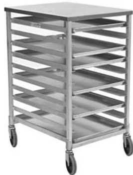
all-welded pan rack #OUR-1810-3/W