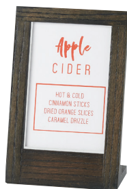
C. CINDERWOOD CARDHOLDERS ITEM 3825-23-87 | 3½Wx2H | Card Size ITEM 3825-46-87 | 4Wx6H | Card Size ITEM 3825-811-87 | 8½Wx11H | Card Size