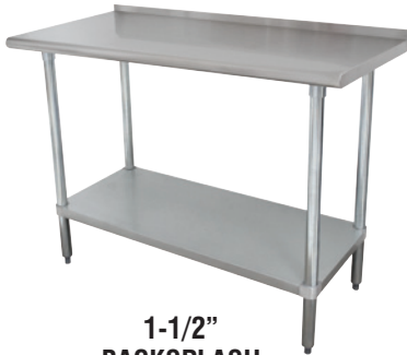
1-1/2" BACKSPASH SFLAG-X Series