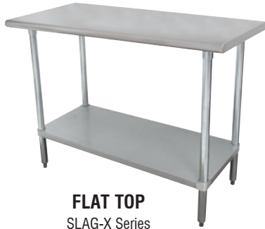
FLAT TOP SLAG-X Series

LEGS: 1 5/8" diameter tubular stainless steel. Stainless steel gussets. 1" adjustable stainless steel bullet feet.