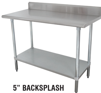
5" BACKSPASH KSLAG-X Series