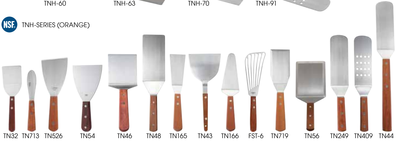
Relative size comparisons shown