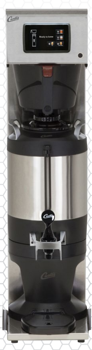
G4CBHS G4 Single Tea/Coffee Combo Brewer 3.0 gal. tea; 1.5 gal. coffee