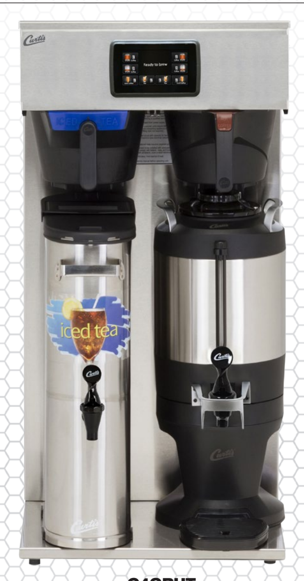
G4CBHT G4 Twin Tea/Coffee Combo Brewer 3.0 gal. tea; 1.5 gal. coffee/side