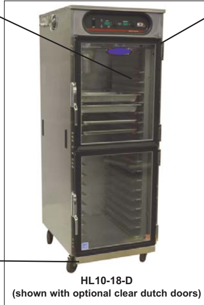
HL10-18-D (shown with optional clear dutch doors)

STAINLESS STEEL DRIP TROUGH... Located at base of door to catch condensation. Easy to remove sliding keyhole design for emptying and cleaning.