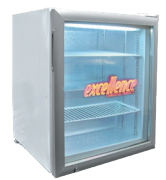
Optional lighted door graphic