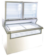
Double Combo-MCT-4HC with 2 optional CTF-3HC