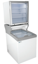
Combo MCT-2HC with one optional CTF-3HC