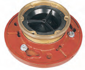
Top of Strainer

The patented 3-part design opens to allow drainage and closes when there is no water flow.