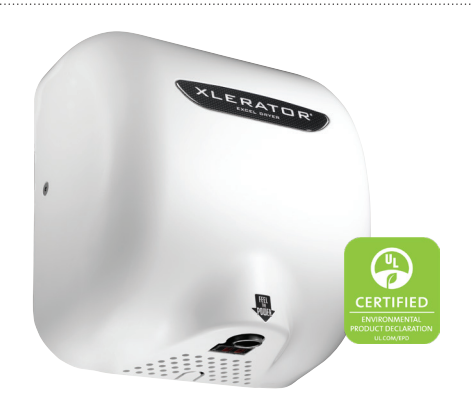
XL-BW White Thermoset Resin (BMC)