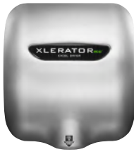
XL-SB-ECO Brushed Stainless Steel