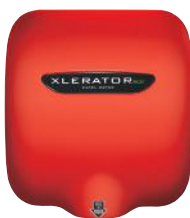
XL-SP-ECO** Custom Special Paint