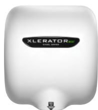
XL-W-ECO White Epoxy Painted