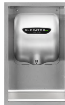
Part # 40502