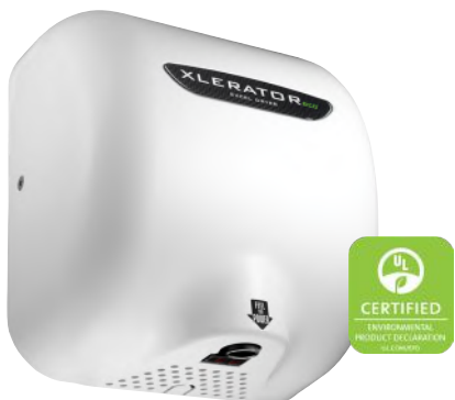
XL-BW-ECO White Thermoset Resin (BMC)

MODELS: XL - BW W GR C SB SI SP - ECO OPTIONS: -1.1N (Noise Reduction Nozzle) -H (HEPA Filter) -VOLTAGE (See Chart)