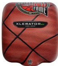
XL-SI-ECO*** Custom Special Image