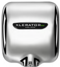
XL-C-ECO Chrome Plated