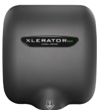
XL-GR-ECO Graphite Textured Painted