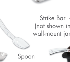
Strike Bar (not shown in wall-mount jar)