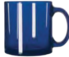
Mug No. 5213B 13 oz./38.5 cl./385 ml. H3¾ T3¾ B3¾ D4¾ 1 doz./13# • .52 cu. ft. SCC 310869