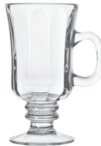
Irish Coffee with optic No. 5294 8¼ oz./24.4 cl./244 ml. H5½ T3½ B2¾ D4½ 2 doz./22# • 1.13 cu. ft. SCC 057986