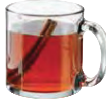
Mug No. 5213 13 oz./38.5 cl./385 ml. H3¾ T3¾ B3¾ D4¾ 1 doz./13# • .52 cu. ft. SCC 886531