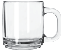
Mug No. 5201 10 oz./29.6 cl./296 ml. H3½ T3½ B2¾ D4½ 1 doz./10# • .44 cu. ft. SCC 708673