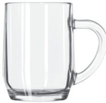
All Purpose Mug No. 5724 10 oz./29.6 cl./296 ml. H4½ T2½ B2¾ D4½ 3 doz./30# • 1.37 cu. ft. SCC 373540