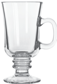
Irish Coffee No. 5295 8½ oz./25.1 cl./251 ml. H5½ T3½ B2¾ D4½ 2 doz./21# • 1.13 cu. ft. SCC 030101