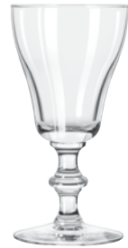
Georgian Irish Coffee No. 8054 6 oz./17.7 cl./177 ml. H5¼ T2½ B2¾ D2½ 3 doz./15# • 1.25 cu. ft. SCC 435095