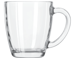
Square Mug No. 5352 14 oz./41.4 cl./414 ml. H4 T3½ B2½ D4¾ 1 doz./10# • .68 cu. ft. SCC 394583