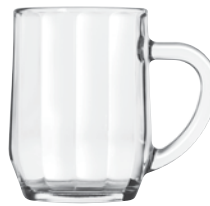
All Purpose Optic Mug No. 5725 10 oz./29.6 cl./296 ml. H4½ T2½ B2¾ D4¾ 3 doz./30# • 1.37 cu. ft. SCC 373557