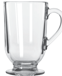
Irish Coffee No. 5304 10½ oz./31.1 cl./311 ml. H5 T3½ B2¾ D4¼ 1 doz./12# • .49 cu. ft. SCC 840298