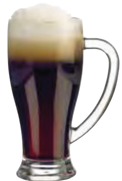
Cafe Mug No. 5286 14 oz./41.4 cl./414 ml. H6¾ T3½ B2½ D5 1 doz./17# • .86 cu. ft. SCC 592061