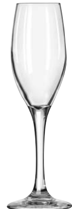
Flute No. 3096 ■ 5¾ oz./17.0 cl./170 ml. H8½ T1½ B2¾ D2¾ 1 doz./6# = .57 cu.ft. SCC 252340 TRAEX TR-7CCC □