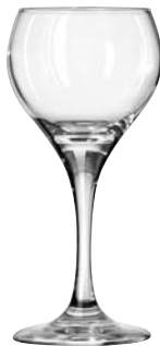
Red Wine No. 3069 ■ 6½ oz./19.2 cl./192 ml. H6½ T2½ B2¾ D3 2 doz./11# = 1.04 cu.ft. SCC 044020 TRAEX TR-13HHH □