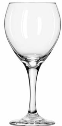
Balloon No. 3061 ■ 20 oz./59.2 cl./592 ml. H8½ T3¼ B3¼ D4¼ 1 doz./9# = 1.22 cu.ft. SCC 077578 TRAEX TR-8DDDD □