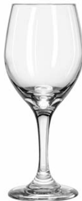
Tall Goblet No. 3011 ■ 14 oz./41.4 cl./414 ml. H8¼ T2¾ B3 D3¾ 2 doz./18# = 1.63 cu.ft. SCC 027924 TRAEX TR-6BBBB □