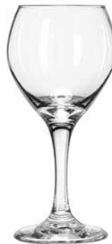
Red Wine No. 3056 ■ 10 oz./29.6 cl./296 ml. H7½ T2¾ B2¾ D3¾ 2 doz./13# = 1.38 cu.ft. SCC 026309 TRAEX TR-6BBB □