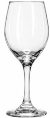
Wine No. 3057 ■ 11 oz./32.5 cl./325 ml. H7½ T2½ B2¾ D3½ 2 doz./14# = 1.33 cu.ft. SCC 019561 TRAEX TR-12HHH □