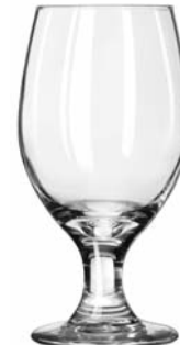
Banquet Goblet No. 3010 ■ 14 oz./41.4 cl./414 ml. H6½ T2¾ B3 D3¾ 2 doz./17# = 1.33 cu.ft. SCC 055118 TRAEX TR-6BBB □