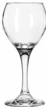
Red Wine No. 3064 ■ 8 oz./23.7 cl./237 ml. H7 T2½ B2¾ D3½ 2 doz./12# = 1.17 cu.ft. SCC 028273 TRAEX TR-12HHH □