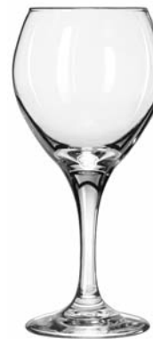
Red Wine No. 3014 ■ 13½ oz./39.9 cl./399 ml. H7¾ T2½ B3 D3¾ 2 doz./16# = 1.75 cu.ft. SCC 028402 TRAEX TR-11GGG □