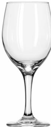
Tall Wine No. 3060 ■ 20 oz./59.2 cl./592 ml. H8½ T3½ B3¼ D3¾ 1 doz./10# = 1.10 cu.ft. SCC 077561 TRAEX TR-11GGGG □