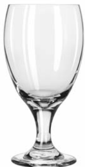
Tall Iced Tea No. 4116SR ✕ ■ 16¼ oz./48.1 cl./481 ml. H7 T3¼ B3 D3½ 2 doz./18# • 1.55 cu.ft. SCC 451333 TRAEX TR-6BBB □