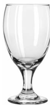
Iced Tea No. 3716 ■ 16¼ oz./48.1 cl./481 ml. H7 T3¼ B3 D3½ 3 doz./28# • 2.31 cu.ft. SCC 516766 TRAEX TR-6BBB □