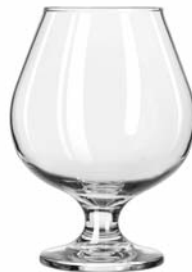
Brandy No. 3708 ■ 17 1/2 oz./51.8 cl./518 ml. H5 1/2 T2 3/8 B2 3/4 D4 2 doz./14# = 1.53 cu.ft. SCC 573929 TRAEX TR-8DD □