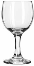
Wine No. 3769 ■ 6½ oz./19.2 cl./192 ml. H5¾ T2½ B2½ D2¾ 2 doz./11# • .79 cu.ft. SCC 370105 TRAEX TR-7CC □