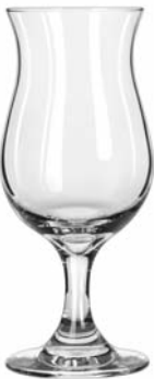
Poco Grande No. 3715 ■ 10½ oz./31.1 cl./311 ml. H7 T2½ B2½ D3½ 2 doz./14# • 1.13 cu.ft. SCC 742301 TRAEX TR-12HHH □