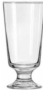
Footed Hi-Ball No. 3737 ■ 10 oz./29.6 cl./296 ml. H6 T2 3/8 B2 3/4 D2 7/8 2 doz./14# = .89 cu.ft. SCC 370037 TRAEX TR-7CC □