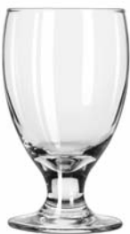
Banquet Goblet No. 3712 ■ No. 3752HT ★ ■ 10½ oz./31.1 cl./311 ml. H5¼ T2¾ B2¾ D3½ 2 doz./14# • .93 cu.ft. No. 3712-SCC 369994 No. 3752HT-SCC 370068 TRAEX TR-6BB □