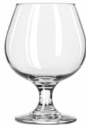
Brandy No. 3705 ■ 11 1/2 oz./34.0 cl./340 ml. H5 T2 1/4 B2 3/4 D3 5/8 2 doz./11# = 1.13 cu.ft. SCC 294596 TRAEX TR-6BB □