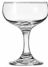
Champagne No. 3773 ■ 5½ oz./16.3 cl./163 ml. H4½ T3¼ B2¾ D3¾ 3 doz./15# • 1.38 cu.ft. SCC 239832 TRAEX TR-6B □