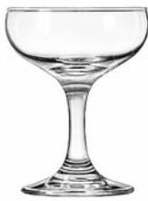
Champagne No. 3777 ■ 4½ oz./13.3 cl./133 ml. H4¼ T3¼ B2¾ D3¾ 3 doz./14# • 1.31 cu.ft. SCC 239849 TRAEX TR-6B □