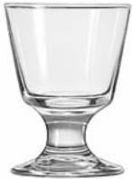
Footed Rocks No. 3746 ■ 5 1/2 oz./16.3 cl./163 ml. H4 1/8 T3 1/8 B2 3/4 D3 1/8 2 doz./13# = .69 cu.ft. SCC 370044 TRAEX TR-12H □