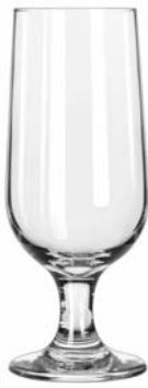
Beer No. 3728 ■ 12 oz./35.5 cl./355 ml. H7 1/8 T2 1/2 B2 3/4 D2 7/8 2 doz./13# = .99 cu.ft. SCC 370006 TRAEX TR-7CCC □