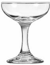
Champagne No. 3787 ■ 3½ oz./10.4 cl./104 ml. H4½ T3¼ B2¾ D3¾ 3 doz./14# • 1.27 cu.ft. SCC 239863 TRAEX TR-6B □