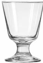
Footed Rocks No. 3747 ■ 7 oz./20.7 cl./207 ml. H4 3/8 T3 1/4 B2 3/4 D3 1/4 2 doz./13# = .81 cu.ft. SCC 370051 TRAEX TR-12H □