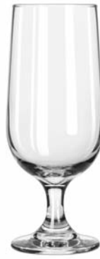
Beer No. 3730 ■ 14 oz./41.4 cl./414 ml. H7 3/8 T2 1/2 B2 3/4 D3 2 doz./14# = 1.15 cu.ft. SCC 370013 TRAEX TR-12HHH □