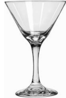
Martini No. 3779 ■ 9¼ oz./27.4 cl./274 ml. H6½ T4¾ B3 D4¾ 1 doz./8# • 1.13 cu.ft. SCC 019578 TRAEX TR-8DDD □