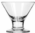
Sorbet No. 3801 ■ 2¾ oz./8.1 cl./81 ml. H2¾ T3½ B2½ D3½ 2 doz./8# • .59 cu.ft. SCC 387738 TRAEX TR-12H □