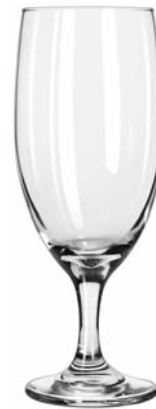
Tall Iced Tea No. 3750 ■ 16 oz./47.3 cl./473 ml. H8¾ T2¾ B3 D3 3 doz./24# • 2.18 cu.ft. SCC 858934 TRAEX TR-6BBB □