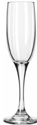
Tall Flute No. 3796 ■ 6 oz./17.7 cl./177 ml. H8¾ T2 B2¾ D2¾ 1 doz./6# • .59 cu.ft. SCC 574650 TRAEX TR-7CCCC □