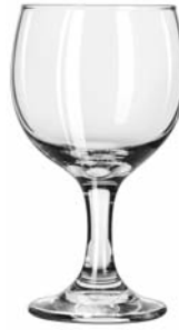
Wine No. 3757 ■ 10½ oz./31.1 cl./311 ml. H6 T3½ B2¾ D3¾ 3 doz./21# • 1.80 cu.ft. SCC 231508 TRAEX TR-6BB □