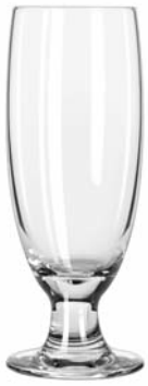
Beer No. 3725 ■ 12 oz./35.5 cl./355 ml. H7 1/8 T2 1/2 B2 3/4 D2 3/4 3 doz./22# = 1.42 cu.ft. SCC 908660 TRAEX TR-7CCC □