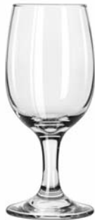
Wine No. 3765 ■ 8½ oz./25.1 cl./251 ml. H6¾ T2¾ B2¾ D2¾ 2 doz./11# • .87 cu.ft. SCC 370099 TRAEX TR-7CC □