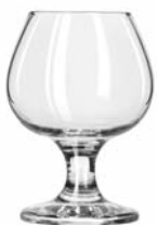
Brandy No. 3702 ■ 5 1/2 oz./16.3 cl./163 ml. H4 1/8 T2 B2 3/8 D2 7/8 1 doz./4# = .33 cu.ft. SCC 574582 TRAEX TR-7C □