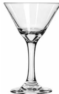
Cocktail No. 3733 ■ 7½ oz./22.2 cl./222 ml. H6½ T4¼ B3 D4¼ 1 doz./7# • .99 cu.ft. SCC 317575 TRAEX TR-8DDD □