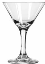
Cocktail No. 3771 ■ 5 oz./14.8 cl./148 ml. H5¼ T3¾ B2¾ D3¾ 3 doz./16# • 1.96 cu.ft. SCC 147991 TRAEX TR-11GG □