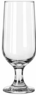
Beer No. 3727 ■ 10 oz./29.6 cl./296 ml. H6 3/4 T2 3/8 B2 3/4 D2 3/4 2 doz./12# = .86 cu.ft. SCC 358646 TRAEX TR-7CCC □