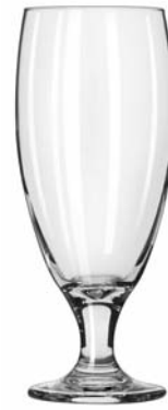
Pilsner No. 3804 ■ 16 oz./47.4 cl./473 ml. H7 3/8 T2 3/4 B2 3/4 D3 1/8 2 doz./15# = 1.28 cu.ft. SCC 391230 TRAEX TR-12HHH □