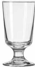
Footed Hi-Ball No. 3736 ■ 8 oz./23.7 cl./237 ml. H5 3/8 T2 3/4 B2 3/4 D2 3/4 2 doz./14# = .75 cu.ft. SCC 370020 TRAEX TR-7CC □