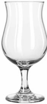
Poco Grande No. 3717 ■ 13¼ oz./39.2 cl./392 ml. H7 T2½ B3 D3½ 1 doz./7# • .69 cu.ft. SCC 702558 TRAEX TR-6BBB □