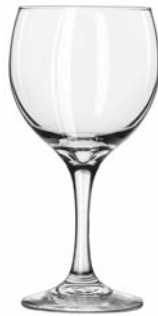
Wine No. 3784 ■ 8¾ oz./25.9 cl./259 ml. H6¾ T2¾ B2¾ D3½ 2 doz./12# • 1.14 cu.ft. SCC 377654 TRAEX TR-12HHH □