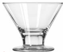
new Dessert/Martini No. 3803 ■ 8 oz./23.9 cl./ 239 ml. H3¾ T4¾ B3 D4¾ 1 doz./ 8# • .65 cu.ft. SCC 418388 TRAEX TR-8D □