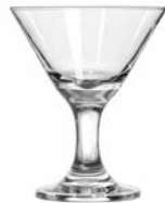
Mini-Martini No. 3701 ■ 3 oz./8.9 cl./89 ml. H3¾ T3½ B2½ D3½ 1 doz./4# • .37 cu.ft. SCC 351548 TRAEX TR-12H □