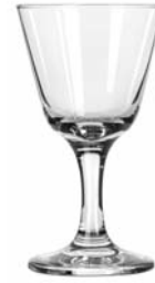
Cocktail No. 3770 ■ 4½ oz./13.3 cl./133 ml. H5½ T2½ B2½ D2½ 3 doz./13# • .90 cu.ft. SCC 239825 TRAEX TR-7CC □