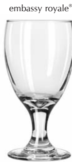
Banquet Goblet No. 3721 ■ 10½ oz./31.1 cl./311 ml. H6 T3 B2¾ D3¼ 3 doz./22# • 1.57 cu.ft. SCC 556755 TRAEX TR-12HH □