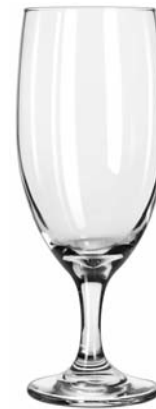
Tall Iced Tea No. 3750 ■ 16 oz./47.3 cl./473 ml. H8¾ T2¾ B3 D3 3 doz./24# • 2.18 cu.ft. SCC 858934 TRAEX TR-6BBB □