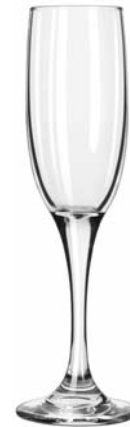
Tall Flute No. 3796 ■ 6 oz./17.7 cl./177 ml. H8¾ T2 B2¾ D2¾ 1 doz./6# • .59 cu.ft. SCC 574650 TRAEX TR-7CCCC □