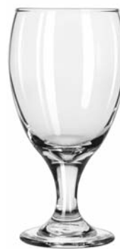
Iced Tea No. 3716 ■ 16¼ oz./48.1 cl./481 ml. H7 T3¼ B3 D3½ 3 doz./28# • 2.31 cu.ft. SCC 516766 TRAEX TR-6BBB □