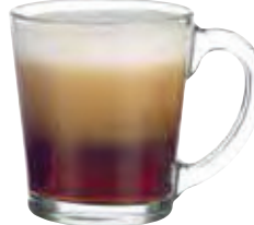
All Purpose Mug No. 5544 13½ oz./39.9 cl./399 ml. H4½ T3¾ B2¾ D5 1 doz./11# • .64 cu. ft. SCC 269673