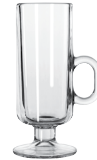
Irish Coffee No. 5292 8 oz./23.7 cl./237 ml. H6½ T2¾ B2¾ D3¾ 2 doz./25# • 1.06 cu. ft. SCC 878161