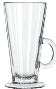
Irish Coffee No. 5293 8½ oz./25.1 cl./251 ml. H5½ T3 B2¾ D3¾ 2 doz./21# • 1.04 cu. ft. SCC 878154