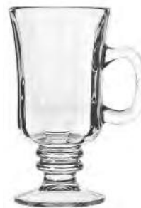
Irish Coffee with optic No. 5294 8¼ oz./24.4 cl./244 ml. H5½ T3½ B2¾ D4½ 2 doz./22# = 1.13 cu.ft. SCC 057986