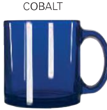
Mug No. 5213B 13 oz./38.5 cl./385 ml. H3¾ T3¾ B3¾ D4¾ 1 doz./13# = .52 cu.ft. SCC 310869