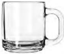
Mug No. 5201 10 oz./29.6 cl./296 ml. H3½ T3½ B2¼ D4½ 1 doz./10# = .44 cu.ft. SCC 708673