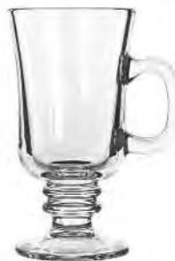
Irish Coffee No. 5295 8½ oz./25.1 cl./251 ml. H5½ T3½ B2¾ D4½ 2 doz./21# = 1.13 cu.ft. SCC 030101