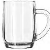
All Purpose Mug No. 5724 10 oz./29.6 cl./296 ml. H4½ T2½ B2¾ D4¾ 3 doz./30# = 1.37 cu.ft. SCC 373540