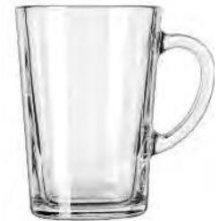
Tall Square Mug No. 5380 16 oz./47.3 cl./473 ml. H5 T3½ B2¾ D4¾ 1 doz./14# = .75 cu.ft. SCC 423518