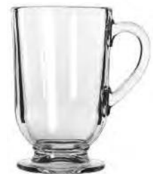
Irish Coffee No. 5304 10½ oz./31.1 cl./311 ml. H5 T3¼ B2¾ D4¼ 1 doz./12# = .49 cu.ft. SCC 840298