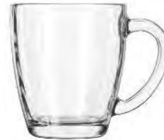
Square Mug No. 5352 14 oz./41.4 cl./414 ml. H4 T3¾ B2½ D4¾ 1 doz./10# = .68 cu.ft. SCC 394583