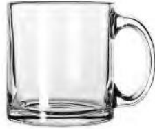
Mug No. 5213 13 oz./38.5 cl./385 ml. H3¼ T3¾ B3¾ D4¾ 1 doz./13# = .52 cu.ft. SCC 886531