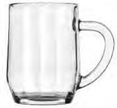
All Purpose Optic Mug No. 5725 10 oz./29.6 cl./296 ml. H4½ T2½ B2¾ D4¾ 3 doz./30# = 1.37 cu.ft. SCC 373557