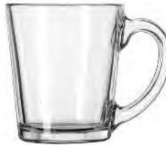
All Purpose Mug No. 5544 13½ oz./39.9 cl./399 ml. H4½ T3¾ B2¾ D5 1 doz./11# = .64 cu.ft. SCC 269673