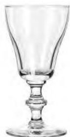
Georgian Irish Coffee No. 8054 ● 6 oz./17.7 cl./177 ml. H5¾ T2¾ B2¾ D2¾ 3 doz./15# = 1.25 cu.ft. SCC 435095