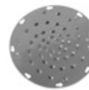
\frac{1}{2} " Shredder Plate