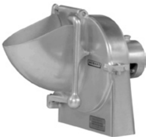
9" VEGETABLE SLICER

The 9" Vegetable Slicer may also be used with the PD-35 or PD-70 Power Drive units.