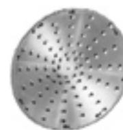
\frac{5}{16} " Shredder Plate