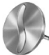
Adjustable Slice Plate - \frac{5}{8} " to very thin.