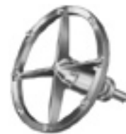
Plate Holder Assembly