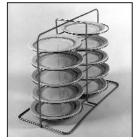
"P" carrier for open plates

OPTIONAL PLATE CARRIERS... "P" or "C" carriers are available. "P" type holds 8-3/4" to 10-1/2" diameter open plates while "C" type holds up to 10-1/2" diameter covered plates. Specify type, if any, when ordering. Carriers will hold plates 4-high (8C or 8P) in carts with 13" shelf spacing and 5-high (10C or 10P) in carts with 16" shelf spacing. See table on front page for types and quantities that will fit in each cart.