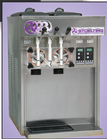
Modified Design for Frozen Yogurt Installations