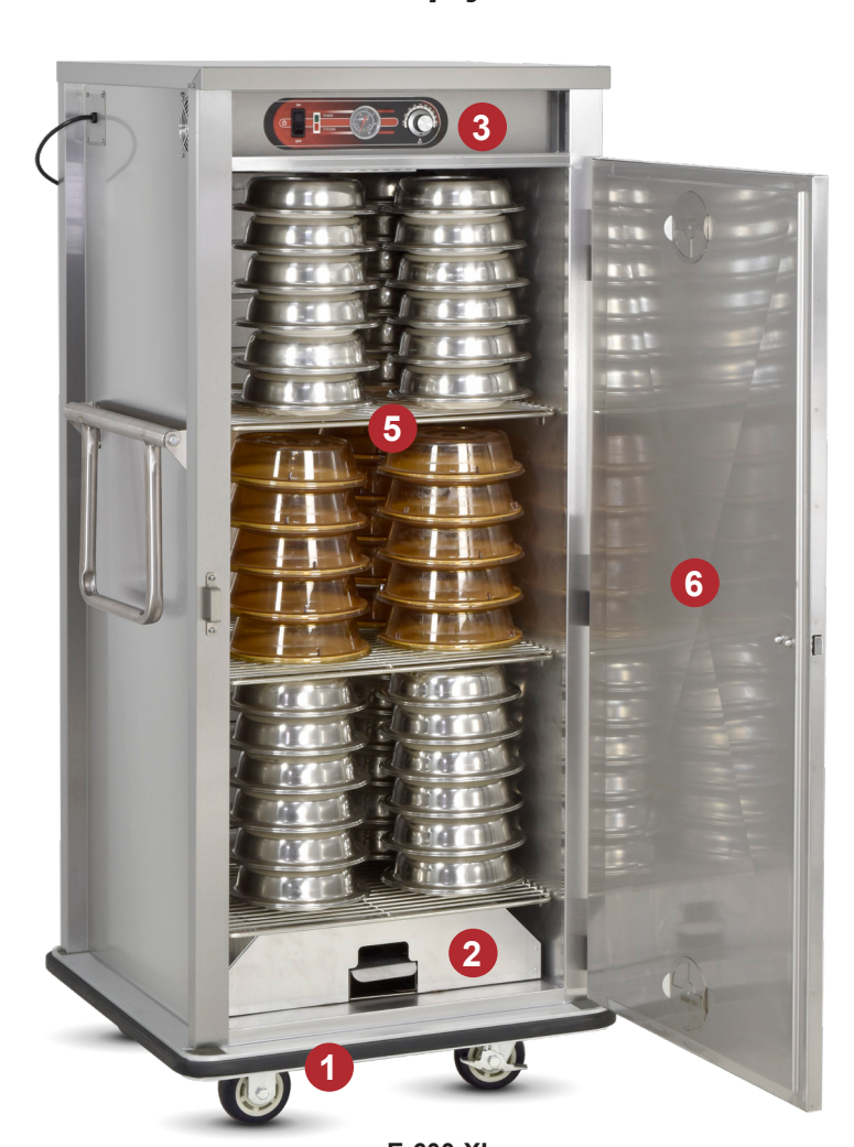
E-600-XL (Model shown with optional ergo-drop down handle)

Sterno or electric heat banquet cabinets are built to handle your most challenging events, on site or off premises, and keep your meals hot and fresh in up to (180) 12.375" plates