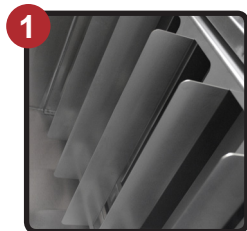
Stainless Steel Tray Racks