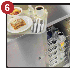
Serve Hot & Cold Foods Together (Shown with optional adjustable tray slides)