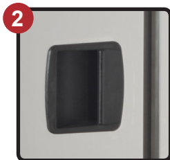
Antimicrobial Door Handle