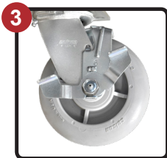
Cart Wash Casters