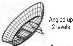
Angled up 2 levels