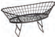
Raised up 2 levels