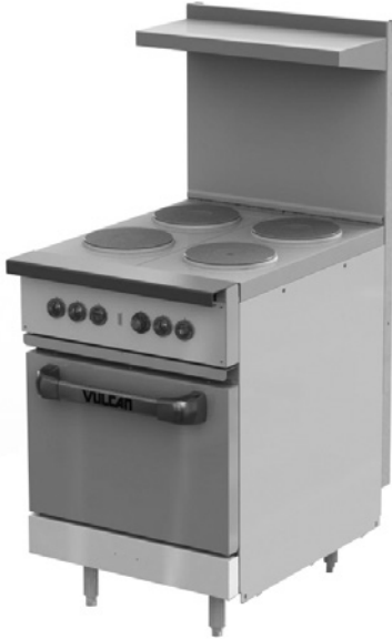
Model EV24S-4FP208 shown with adjustable legs