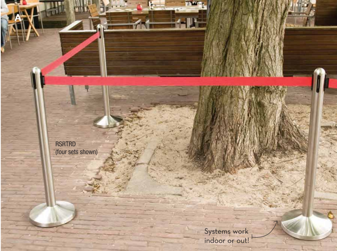
RSRTRD (four sets shown)