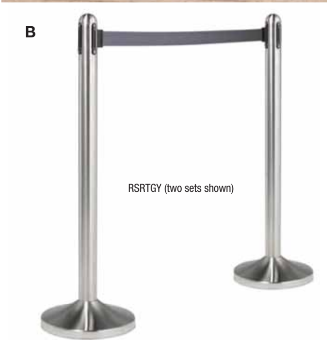
RSRTGY (two sets shown)

Each unit includes easy-to-install hardware to attach to two walls