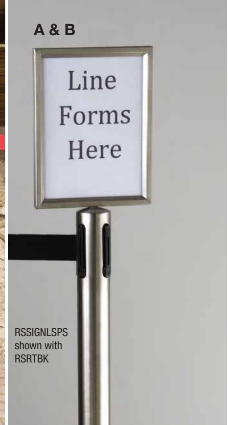
RSSIGNLSPS shown with RSRTBK