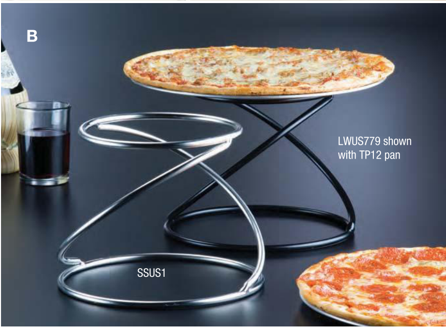
LWUS779 shown with TP12 pan