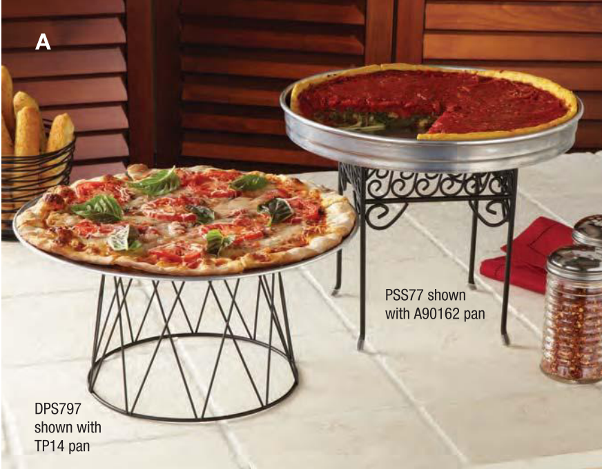
DPS797 shown with TP14 pan