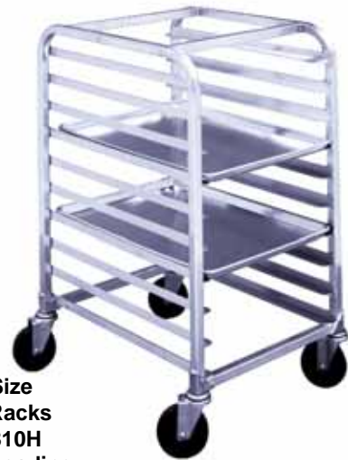
1/2" Size Pan Racks AL-1810H End Loading