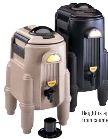
CSR5 Shown in Black.

Height is approximately 7" from counter to spigot.