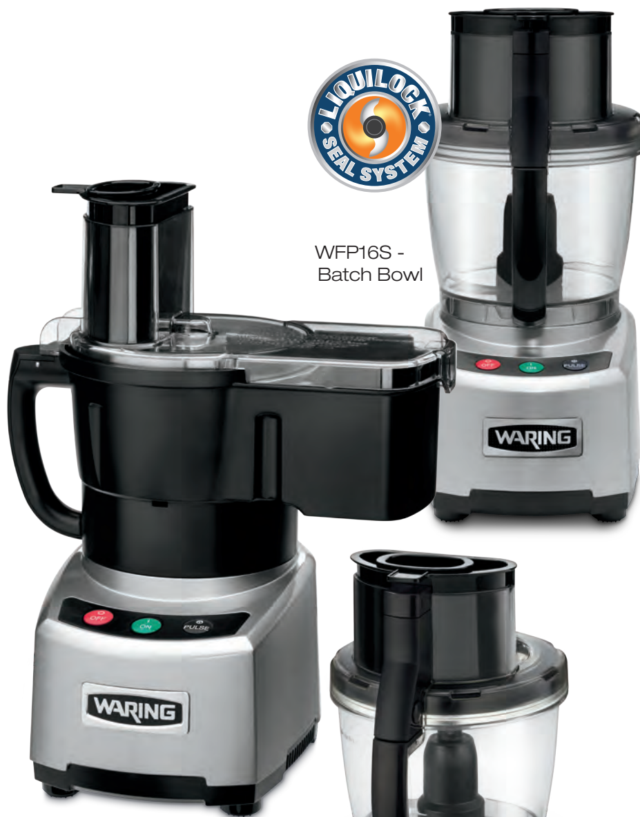
WFP16SCD - Dicing/Continuous Feed Chute and Batch Bowl