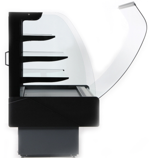
TILT-OUT FRONT GLASS