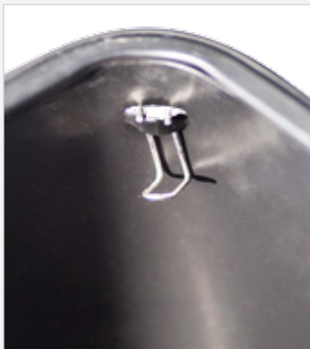
Step 3: "J" portion of hook should point to center