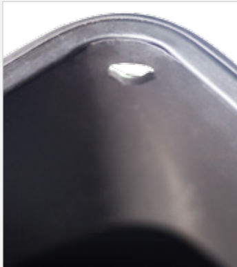
Step 1: Locate slot opening in corner