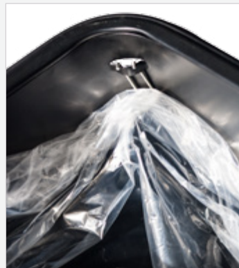
Step 4: Secure bag over J hook