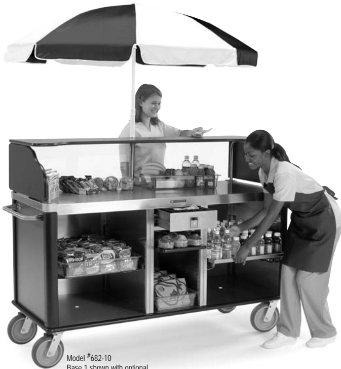
Model #682-10 Base 1 shown with optional slide-out and universal shelves, cash drawer and umbrella.

Stainless Steel with Laminate Exterior and Serving Counter