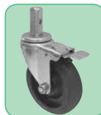
ALRC-5STK 5" caster with brake