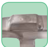
Bolt caps are welded over completely to form extra-strength juncture