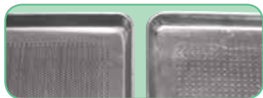
WINCO's "dense" perforation vs. others