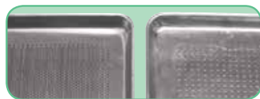
WINCO's "dense" perforation vs. others