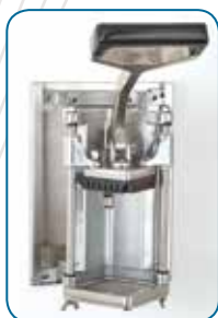
Can be mounted to wall or counter