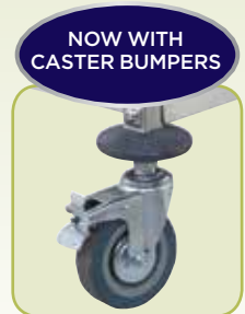
4" caster with brake and bumper