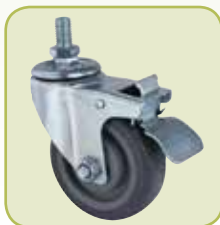
SRK-CTB 4" caster with brake