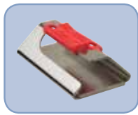
Nested together for additional weight