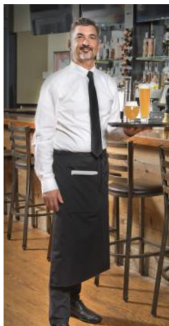
Full length bistro Model: 6'