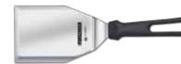
KT63687 5" x 4" Hamburger Turner