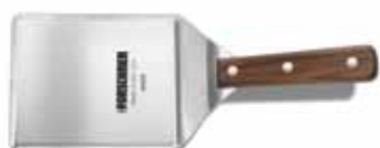
40408 5" x 6" Hamburger Turner, Stiff, 3 Sides Beveled